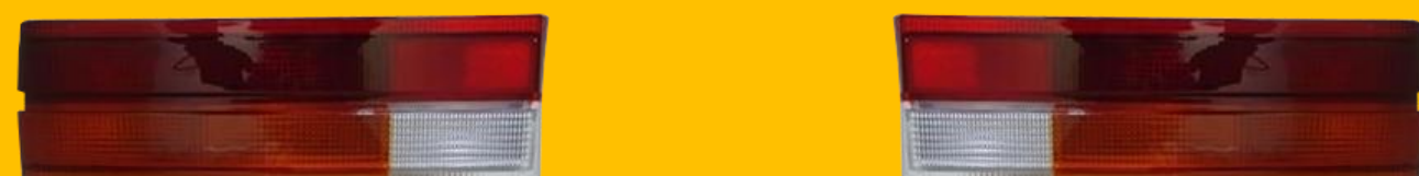
OPALA: 1988, 1989, 1990, 1991, 1992, TRICOLOR