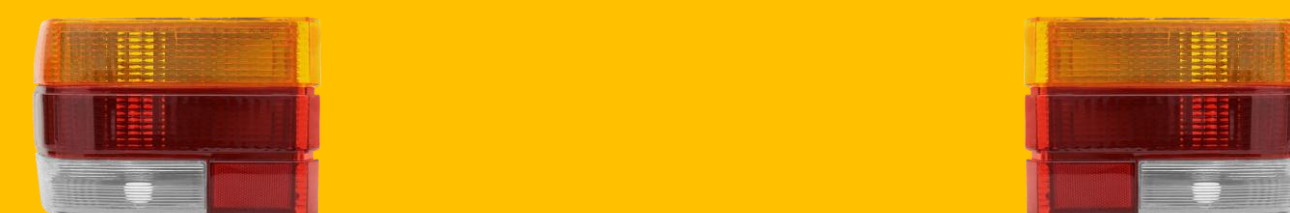
CHEVETTE: 1983, 1984, 1985, 1986, TRICOLOR