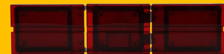
OPALA, APLIQUE CENTRAL: 1988, 1989, 1990, 1991, 1992, RUBI