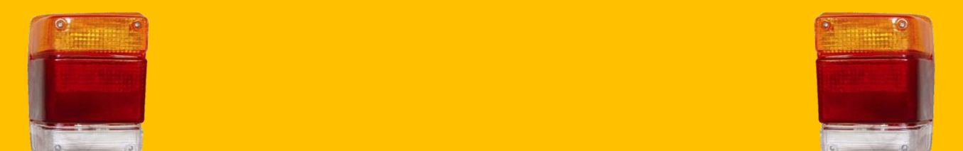
CHEVY 500: 1983, 1984, 1985, 1986, 1987, 1988, 1989, 1990, 1991, 1992, 1993, 1994, 1995, TRICOLOR