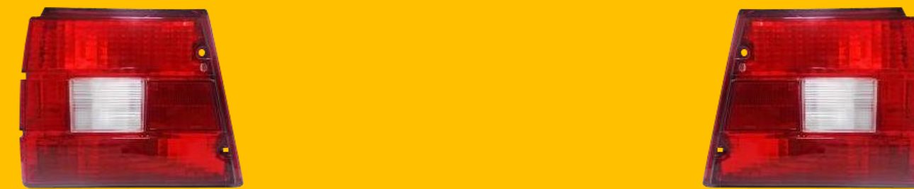
CARAVAN: 1986, 1987, 1988, 1989, 1990, 1991, 1992, TRICOLOR