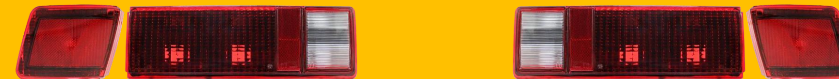
CHEVETTE: 1980, 1981, 1982, BICOLOR