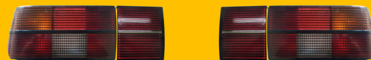
MONZA CLASSIC: 1988, 1989, 1990, TRICOLOR, COM FRISO